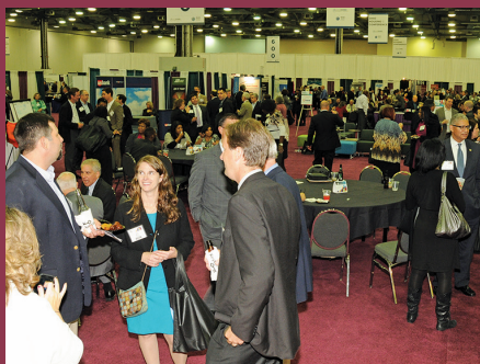
Exhibit Hall C at Convention Center Tuesday, December 1 5:30 PM - 7:30 PM